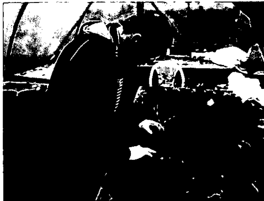
A member of Autism Initiatives enjoying the garden

Autism Initiatives UK provide direct support for over 600 individuals in over 80 locations throughout the UK. They enable persons within the autism spectrum to be fully included, participating members of their community through advocacy, public awareness and education.