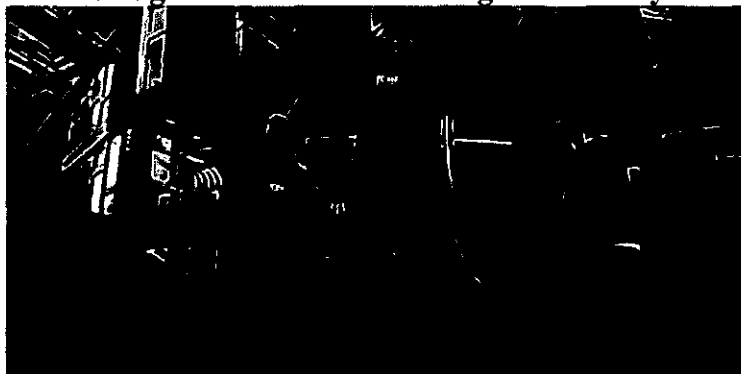
Fairbridge in Scotland celebrate after being awarded £8,877 from People's Postcode Trust

National charity Fairbridge was set up in 1986, with the purpose of supporting young people aged 13-25, who are often from socially excluded backgrounds. The charity helps to develop the confidence, motivation and skills teenagers and young adults need to turn their lives around. In Glasgow, the charity works with approximately 200 young people a year. People's Postcode Trust awarded this notable cause £8,877 to allow the charity to deliver 2 courses – one which discusses sectarianism, and one which educates on gangs and knife crime.