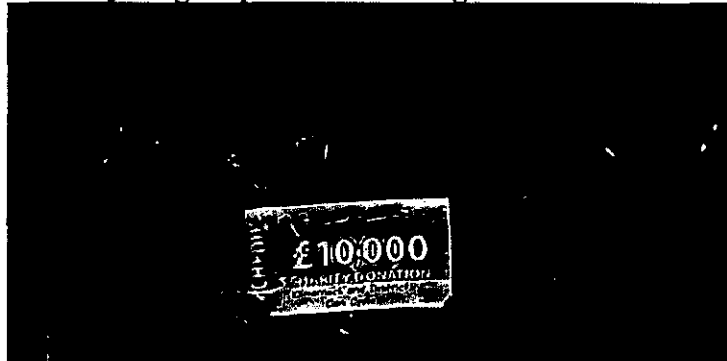
Kilmarnock & District Can Cycle with their BIG cheque

In August 2009, Killie Can Cycle approached People's Postcode Trust. This charity offers free bike repair services to local residents, safe cycle training and low cost bicycles to local children. This is innovatively funded by the recycling of aluminium cans from local schools, shops and pubs. The charity applied for funding for the purchase of a new van to enable the collection of the cans for recycling. People's Postcode Lottery awarded £10,000 to the charity to support the charity, which also recycles bicycles for the Third World.